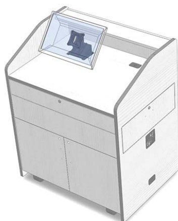
PLM1022 installed on an AVF podium (Sold separately)